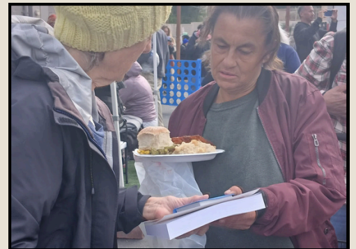
November: Thanksgiving Outreach with Restoration and Recovery