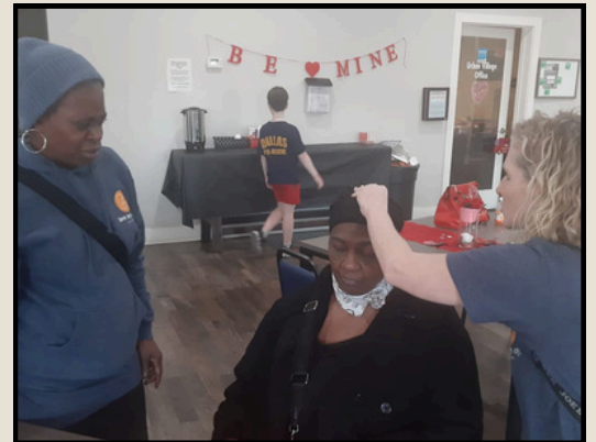
February: Valentine's Day celebration at Lake Tonopah Senior Community