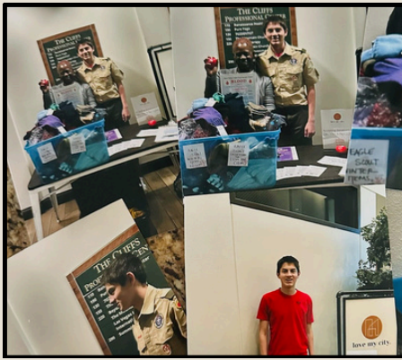
January: Blood Drive with Boy Scouts of America