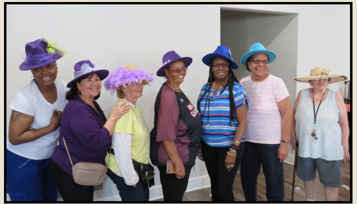
May: Mother's Day hat designing contest at Lake Tonopah Senior Community