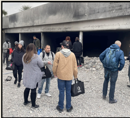
January: Helping the unhoused in the tunnels with Shine a Light foundation