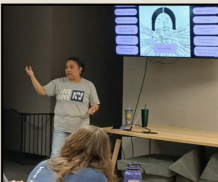
May: HOPE Advocacy training about overdose prevention