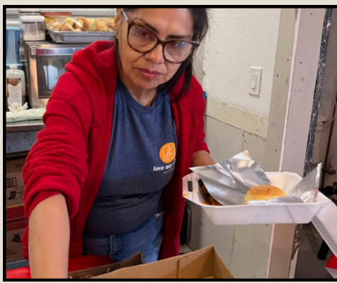
March: Feeding the unhoused at Restoration and Recovery Event