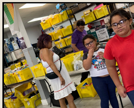
August: Back to School Outreach